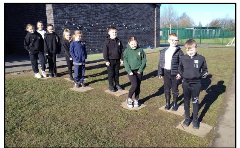
A place where every child can achieve, believe and celebrate in maths!